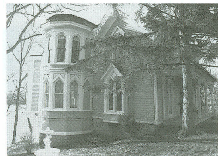
The Hubbell House, showing the bay windows.