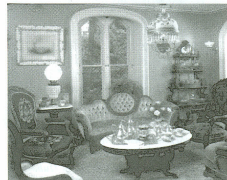
The front parlor, as it has been restored.