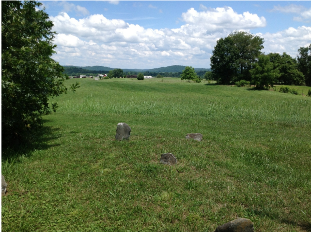
General view looking east from the cemetery

Starnes Cemetery: There is a road running up to the cemetery off of Mark Welborn Rd. In 2013 the road sign read Starns Cem. Rd. On Google maps in 2017 the road is identified as St. Agnes Cemetery Rd. This cemetery has also been called Rambo Farm Cemetery.