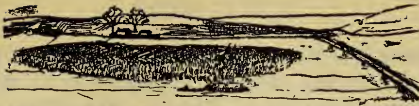
ASH CREEK - PENFIELD MILLS - 1772