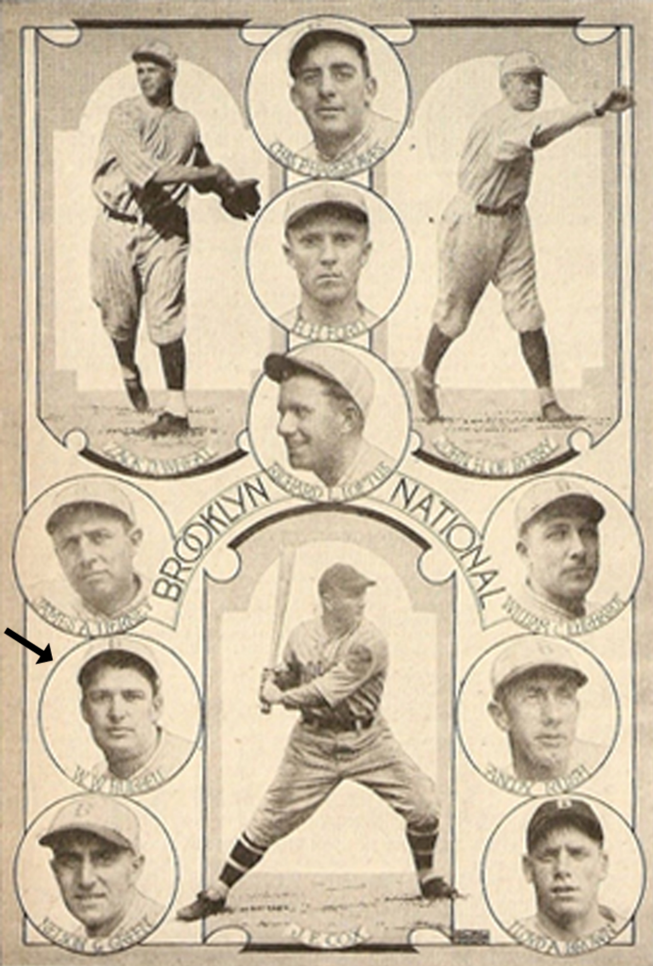
1925 Brooklyn Dodgers