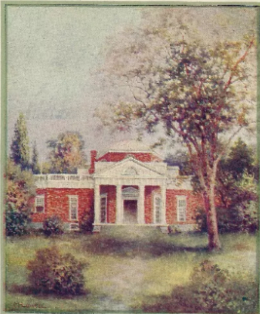
4822 MONTICELLO, HOME OF JEFFERSON COP. 1910 BY THE S.-B. CO., JOLIET, ILL., U.S.A.