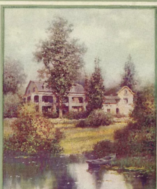
4827 CEDARHURST, HOME OF BRYANT COP. 1910 BY THE S.-B. CO., JOLIET, ILL., U.S.A.

"There may be fairer spots on earth, But all their glories are not worth The virtue of the native sod." —Bryant—An Invitation to the Country.