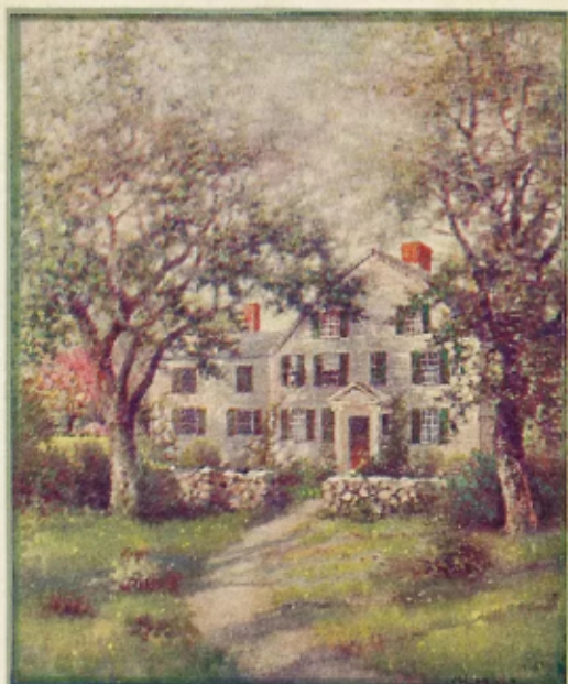
4826 BIRTHPLACE OF OLIVER WENDELL HOLMES COP. 1910 BY THE S.-B. CO., JOLIET, ILL., U.S.A.

"Full of fancy, fun, feeling, or spiced with satire, In a measure so kindly you doubt if the toes That are trodden upon are your own or your foe's."—Lowell.