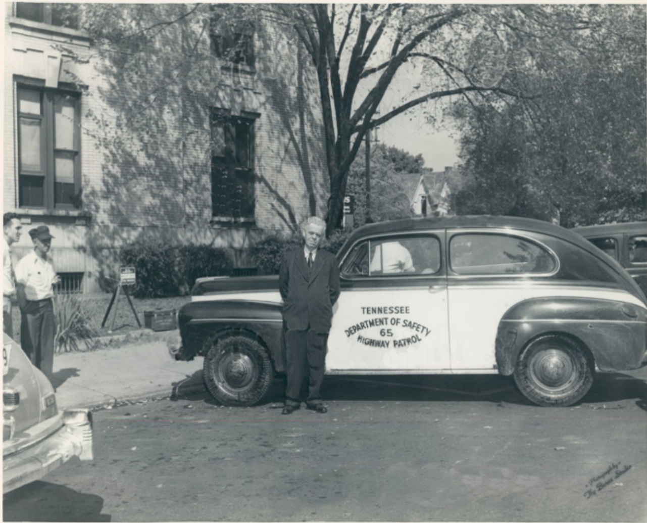
Pictured above is Charles H Hubbell of Cleveland, Ohio, candidate at the November election for the office of Judge of the Supreme Court of Ohio, before the Bradley county court house in Cleveland, Tennessee when he has been engaged in litigation during the past ten days. Hubbell says his opponent will not receive a single solitary vote in the City of Cleveland