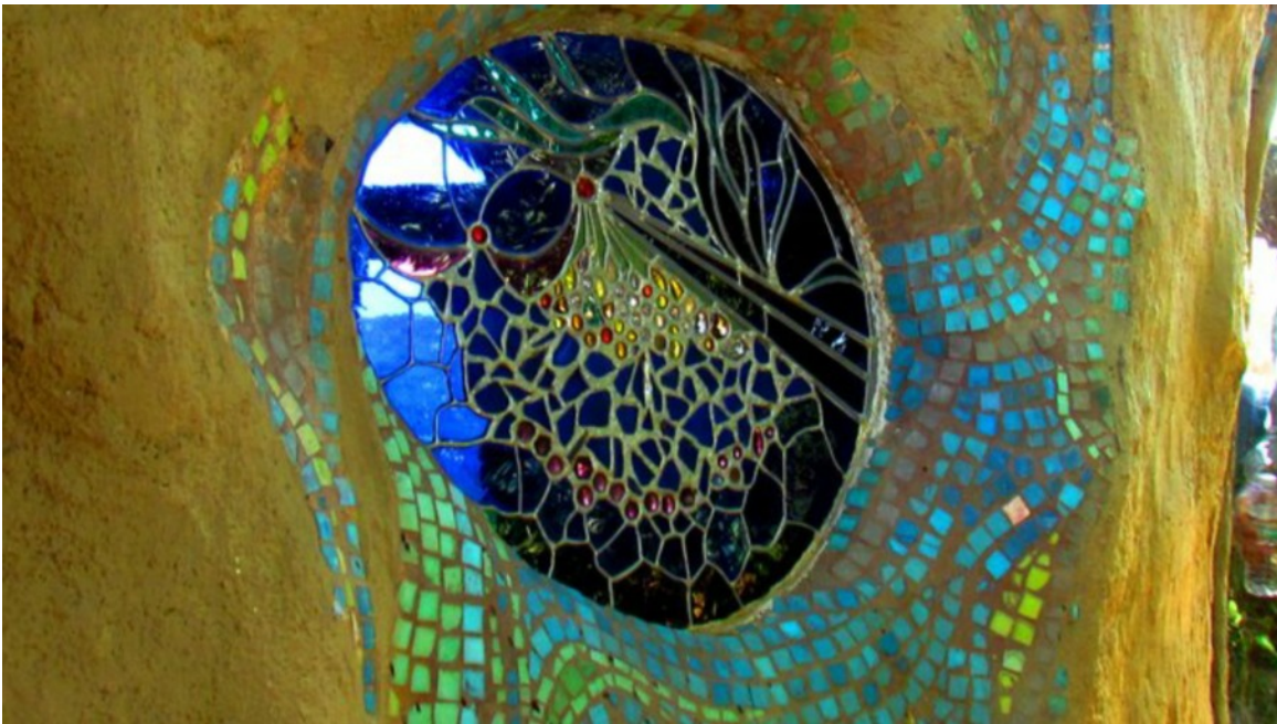
Stained Glass Window and mosaic outside Hubbell's hut