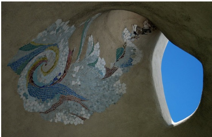
Detail in Hubbell's Hut