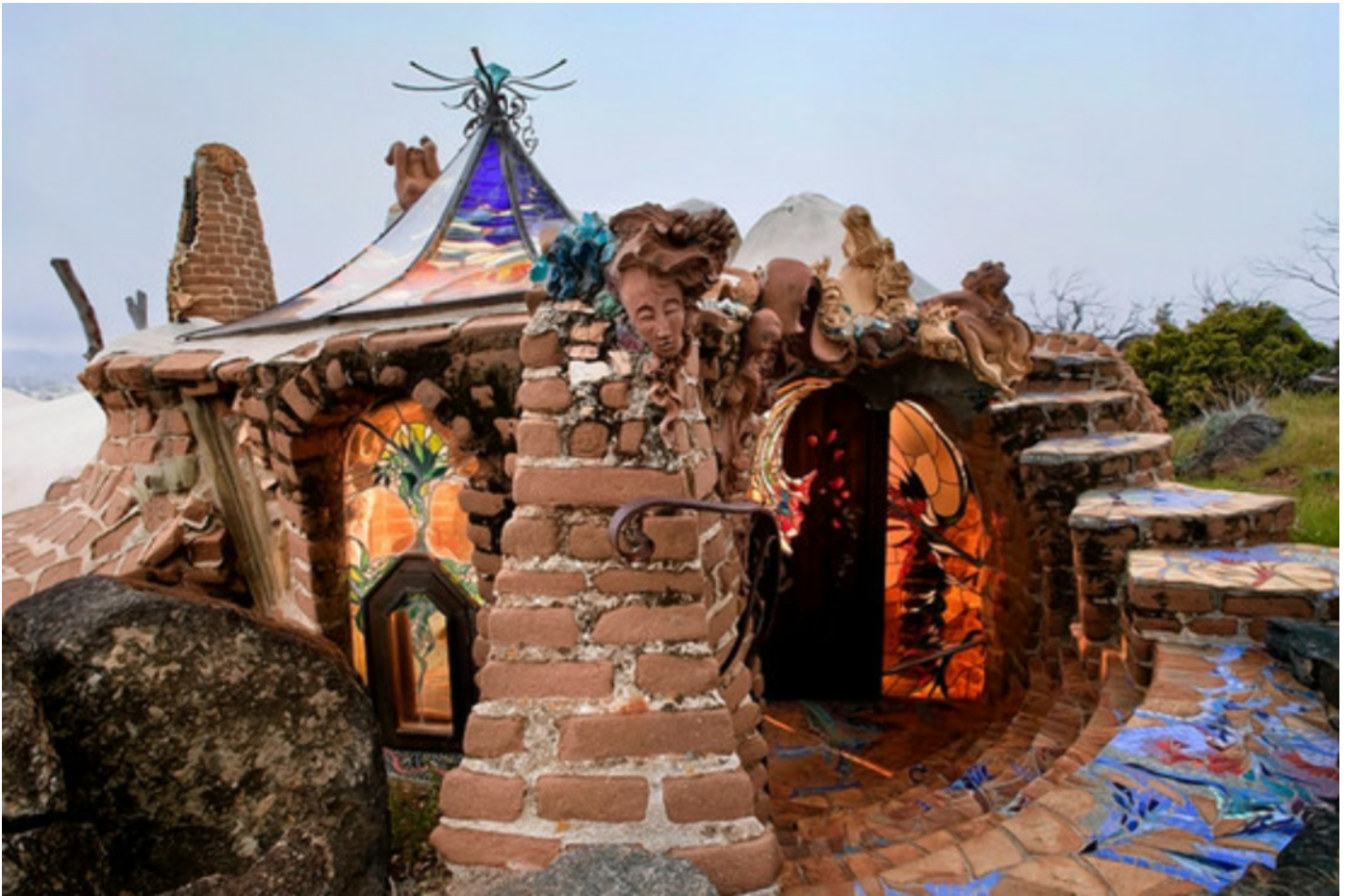
'The Boys' House' was built by artist James Hubbell for his sons in 1973, on his property near San Diego. The house incorporates brick, granite from around the site, stained-glass windows and plenty of curvy lines (even the doors are framed without right angles). As each of James' sons turned 14, they moved into the Boys' House.