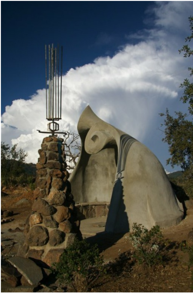
Chapel on the property