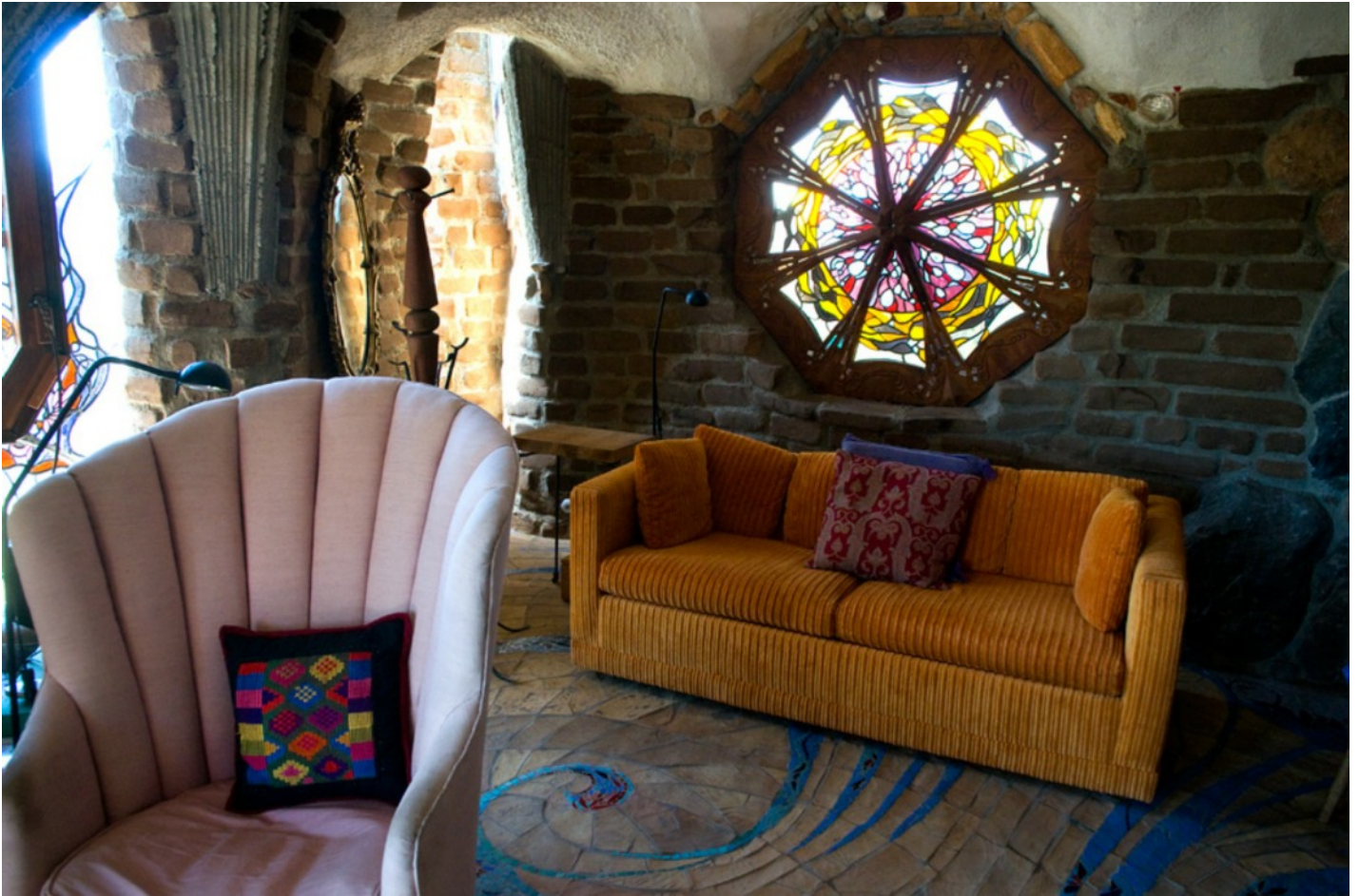
Living Room in Hubbell's Hut