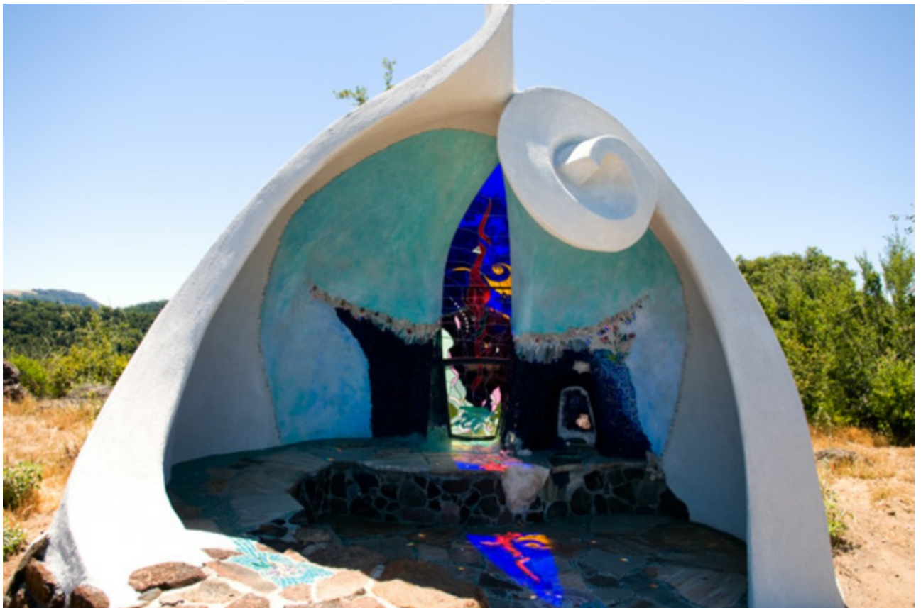
Small Sanctuary on the property