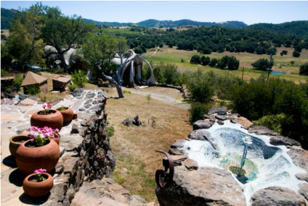
Partial View of Property