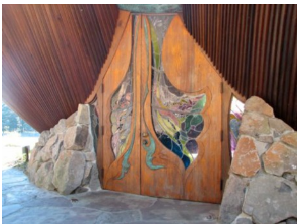
Above: Chapel Doors