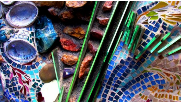
Boy's House: Shower