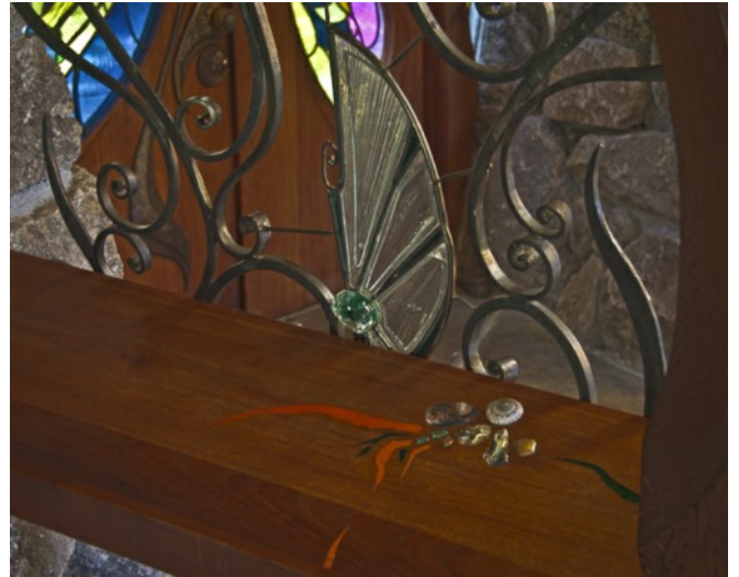
Detail in Hubbell's Hut