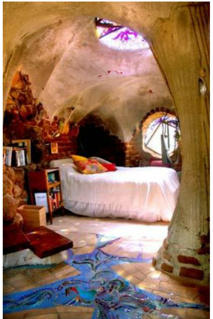
Bedroom in Hubbell's Hut