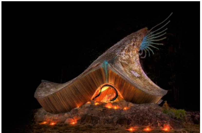
Above: Chapel at night.