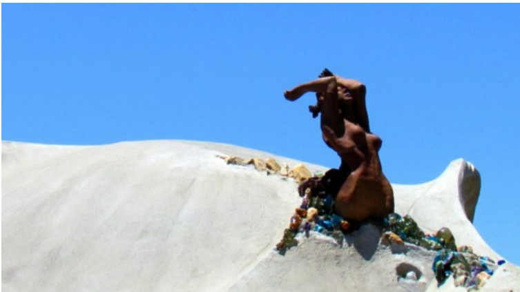
Boy's House: Roof