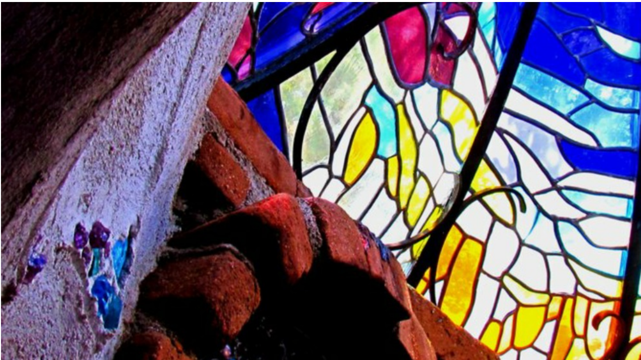
Boy's House: Bathroom stained glass Sky dome