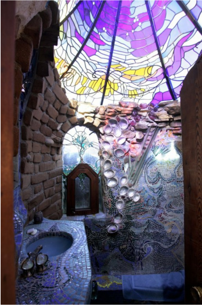
Boy's House: The Bathroom