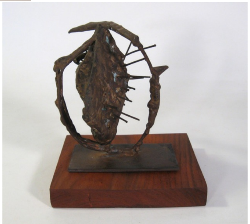
Untitled: Welded Copper